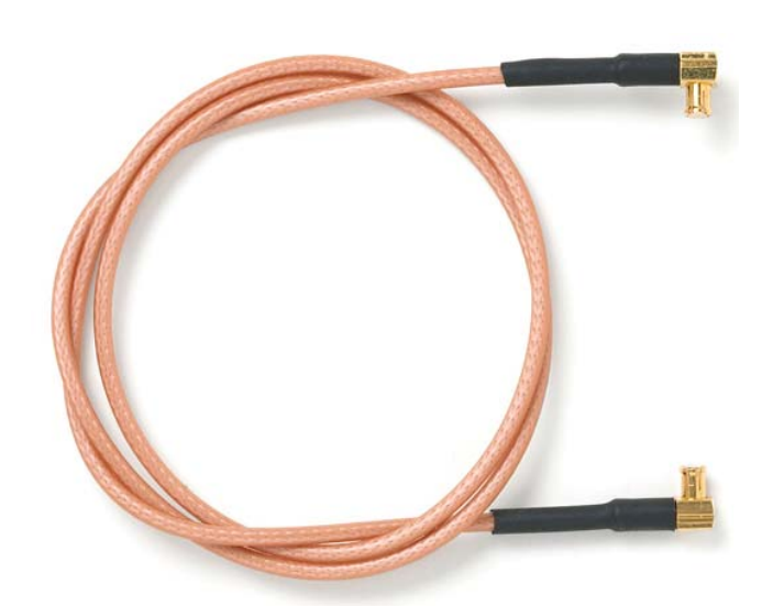
Model 73068 MCX Right-Angle Plug to MCX Right-Angle Plug, RG316/U