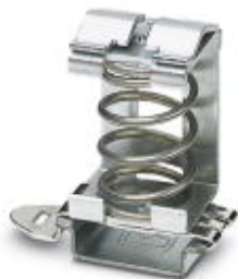
Shield connection terminal block, for applying the shield to busbars

Please be informed that the data shown in this PDF Document is generated from our Online Catalog. Please find the complete data in the user's documentation. Our General Terms of Use for Downloads are valid ( http://phoenixcontact.com/download )