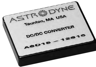
Unit measures 1.6"W x 2"L x 0.375"H